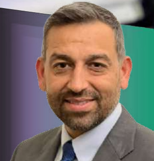
المدينة الملكية لمحافظة أبها Royal Commission for AlUla

➔ Get in touch for speaking and sponsorship enquiries